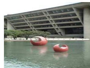
Dallas City Hall located 1500 Marilla

The 3-1-1 and 9-1-1 staff are available twenty-four hours a day and seven days a week. Making those phone calls and initiating