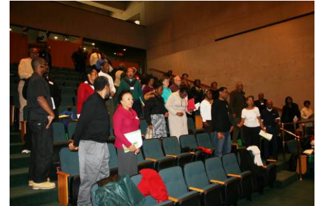
Attendees standing to stretch their legs for round hour 3 of the civic academy.